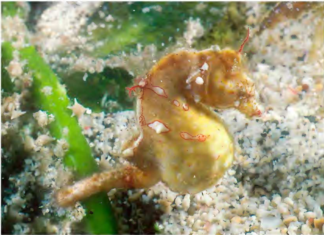
Fig. 2. Hippocampus colemani, paratype AMS I41181-002, in situ.